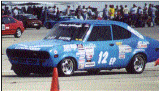
Todd Peck EPX