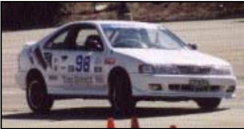
Gary Phillis ES