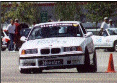
Bob Tunnell ESPX

Meet your Top 20 Drivers by average for their top 6 events: