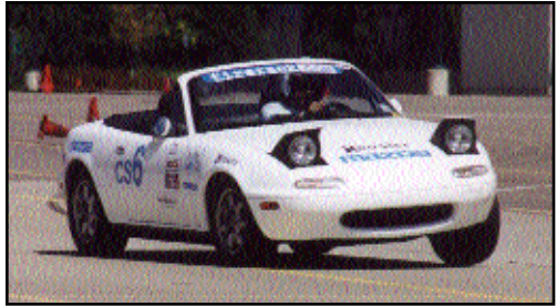
Dale Kirstein CS