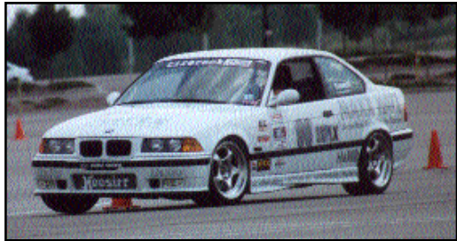
Patty Tunnell ESPLX