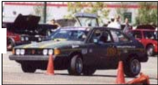
Kevin Wenzel FSP