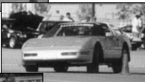
Forrest Thompson Super Stock