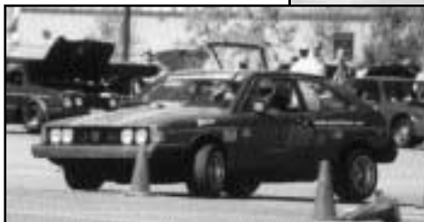
Kevin Wenzel F Street Prepared