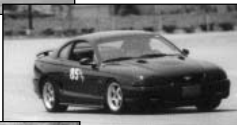
Glen Outcalt E Street Prepared