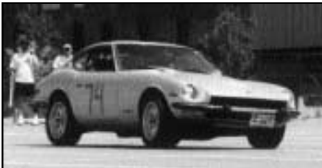
Rob Winter Street Modified