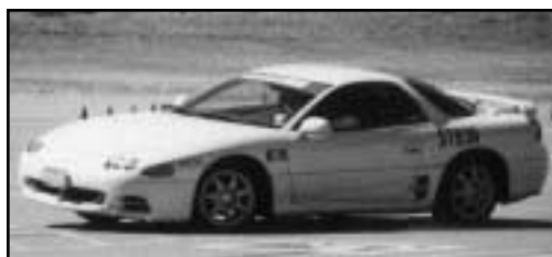
Brad Perdue Street Touring Race Tires