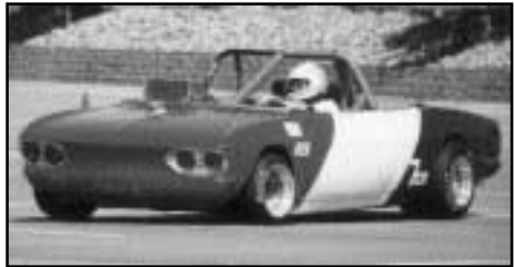
Harlan Colburn E Modified