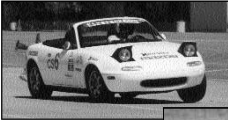
Dale Kirstein C Stock