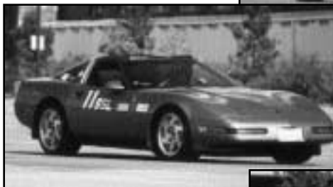
Melanie Pora Super Stock Ladies