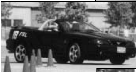
Sara Sugrue F Stock Ladies