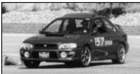
Ashby Floyd Street Touring