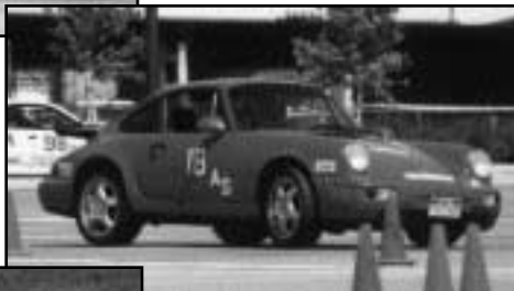
Corky Newcombe A Stock