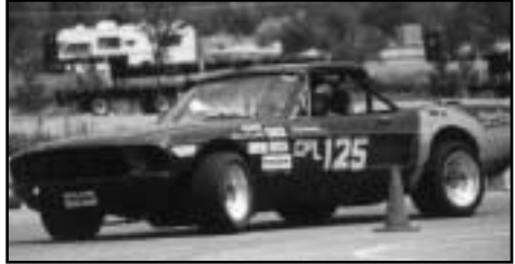
Shannon Short C Prepared Ladies