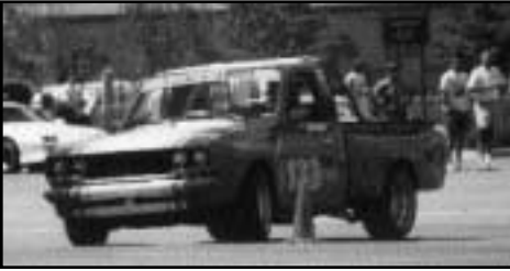
Kathy Wolfskill F Street Prepared Ladies