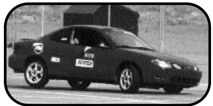
Don Seyfer's our lone Street Touring competitor