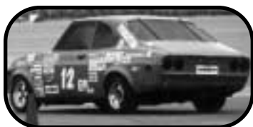
Todd Peck shows some awesome stuff in EP claiming the victory over 2-time Nat'l Champ Grady Wood