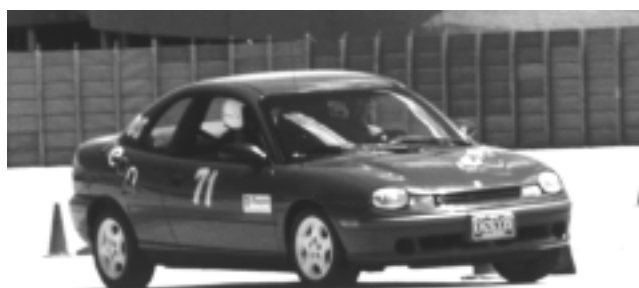
Fred Slick not only wins DS, but brings all his neighbors out to try Soloing—Our Hero!!