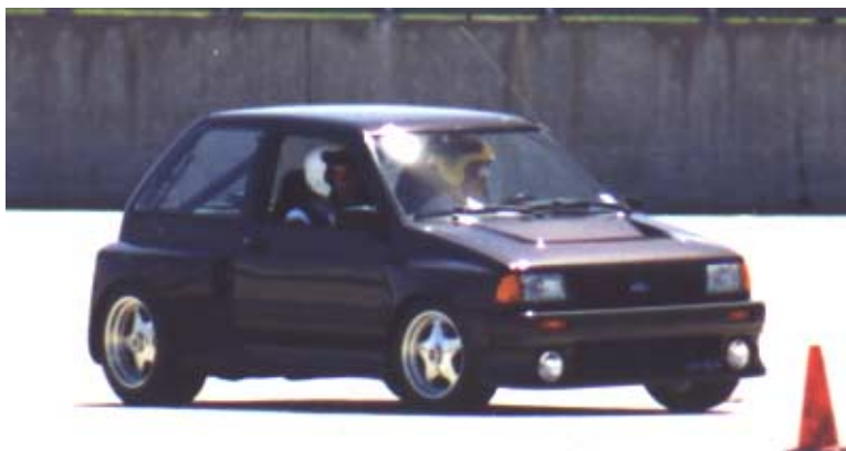
The rarest of all '91 Shogun Festiva drew a real crowd—it has a Taurus SHO engine in back seat!